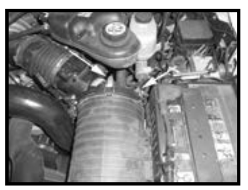
Step 4 Unlatch the two retaining clips and remove the back half of the factory airbox.