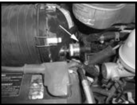
Step 3 Remove the filter minder from the back of the airbox.