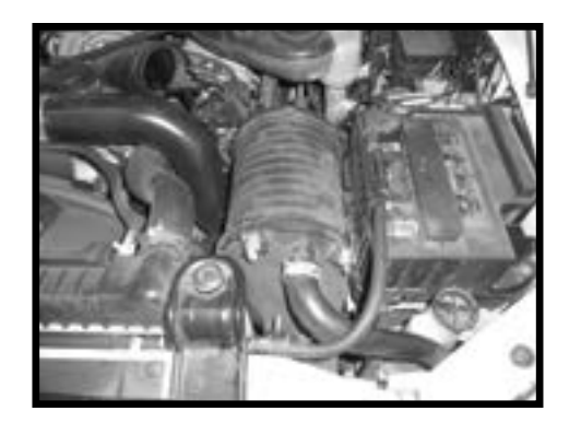
Step 5 Remove the factory air box from the vehicle by lifting up and out on the backside of the airbox.