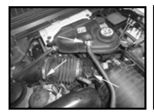
Step 2 Disconnect the electrical connector at the Mass Air Flow Sensor (MAFS). Disconnect the radiator overflow line and loosen the clamp at the end of flex inlet.

Safety first! Before you begin the installation, make sure that the vehicle is in park (or neutral for a manual transmission) with the parking brake set. Disconnect the negative battery terminal and verify that all components that are listed are present. Note: This kit was designed and tested on a stock engine without any custom tuning done to the engine computer. Removing the battery cable may erase the programmed radio stations. The anti-theft code will need to be entered into some radios after the battery cable is connected. The anti-theft code can typically be found in the owner's manual or at your local dealership.