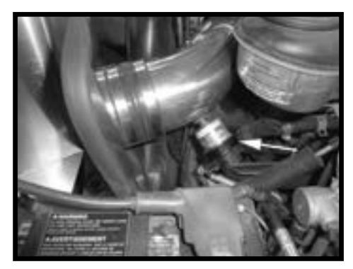
Step 14 the tube.