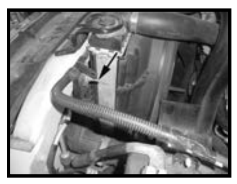
Step 9 Remove the factory stud.

Step 8 Using the supplied screws, install the MAFS onto the tube. Install the grommet into the tube as shown.