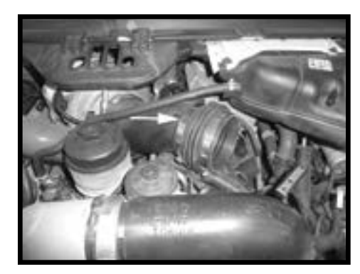
Step 11 Install the flex boot onto the turbo inlet.

Loosen the battery terminals and remove them from the battery. Unclip the factory battery cover and lift up 1/2" this will allow the new heat shield to fit in place.