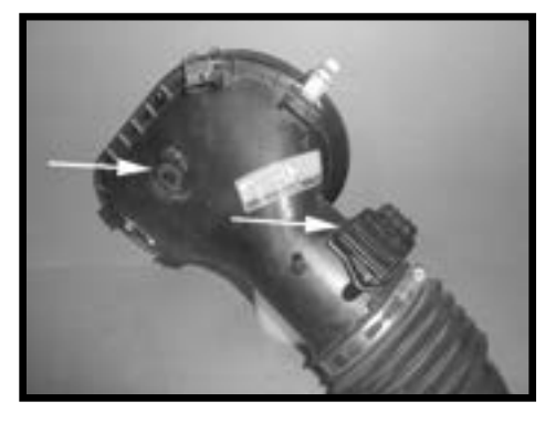
Step 7 Remove the MAFS from the factory intake tube. Remove the factory grommet for the filter minder.