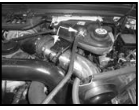
Step 13 Install the intake tube. Reconnect Reinstall the filter minder into the MAFS and the radiator overflow line.

Step 12 Install the heat shield as shown. Once in place fasten securely with hardware supplied. Snap battery cover down in place.